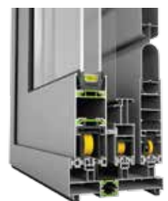
AS 38 ECO SLIDE