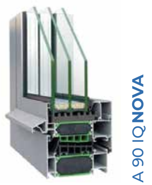
A 90 IQ NOVA