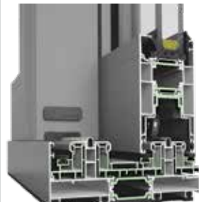
AS 50 LIFT SLIDE