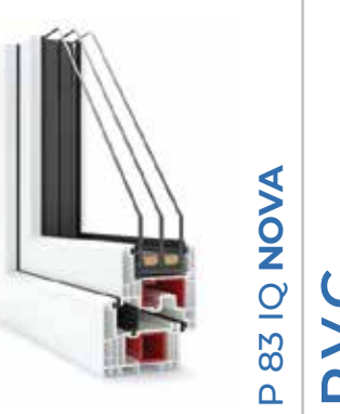
P 83 IQ NOVA