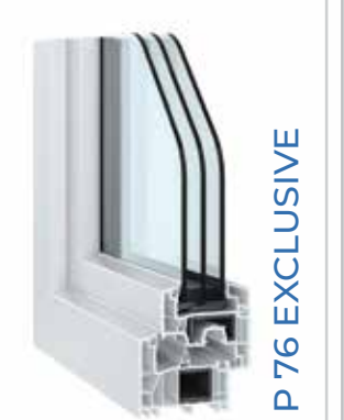
P 76 EXCLUSIVE