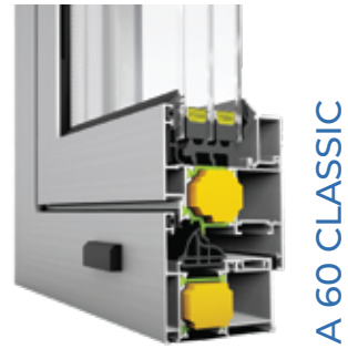
A 60 CLASSIC