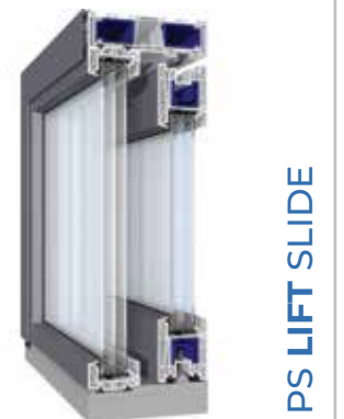
PS LIFT SLIDE