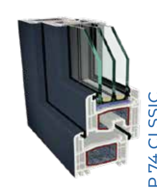
P 74 CLSSIC