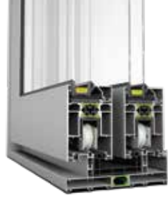
AS 70 LIFT SLIDE