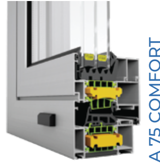
A 75 COMFORT