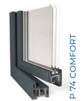
P 74 COMFORT