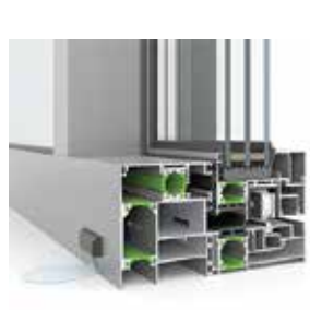
AS 90 LIFT SLIDE